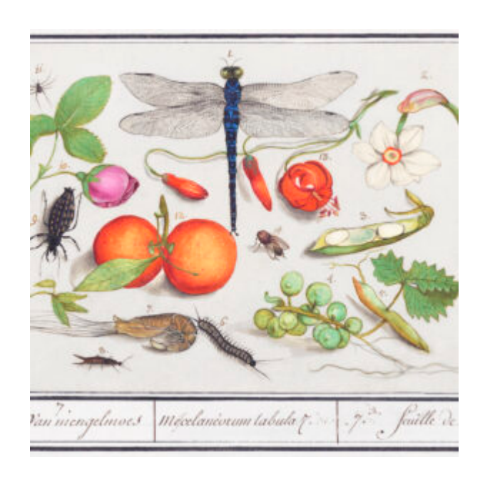
Drawing source material: Wild flowers