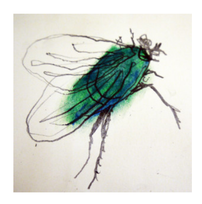
This is featured in the 'Flora and Fauna' pathway