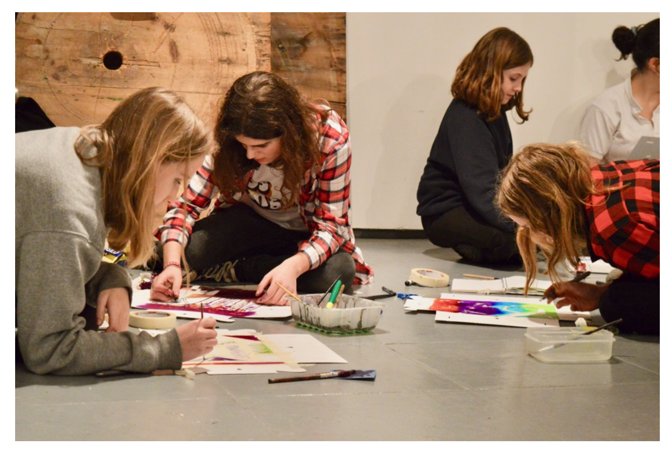
Schools, Colleges, Arts Organisations: Single and Multi-Users From £42

AccessArt is a UK Charity and we believe everyone has the right to be creative. AccessArt provides inspiration to help us all reach our creative potential.