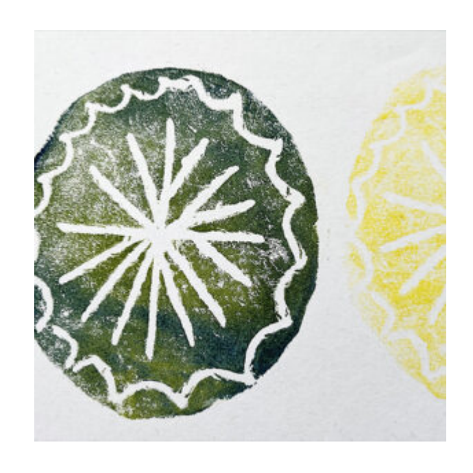
Featured in the 'Simple Printmaking' pathway