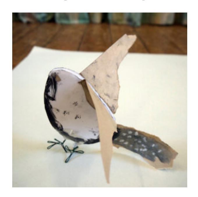
Featured in the 'Making Birds' pathway Collaging with Wax Crayon Rubbings