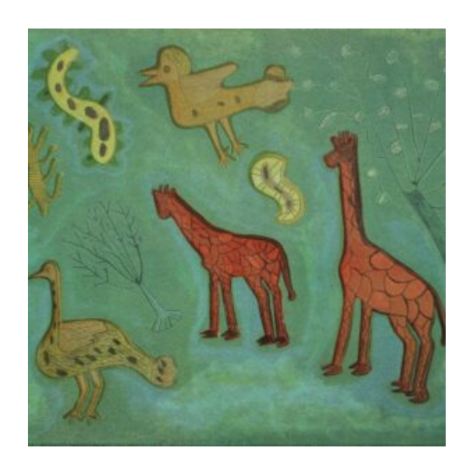
Video enabled monoprint resources