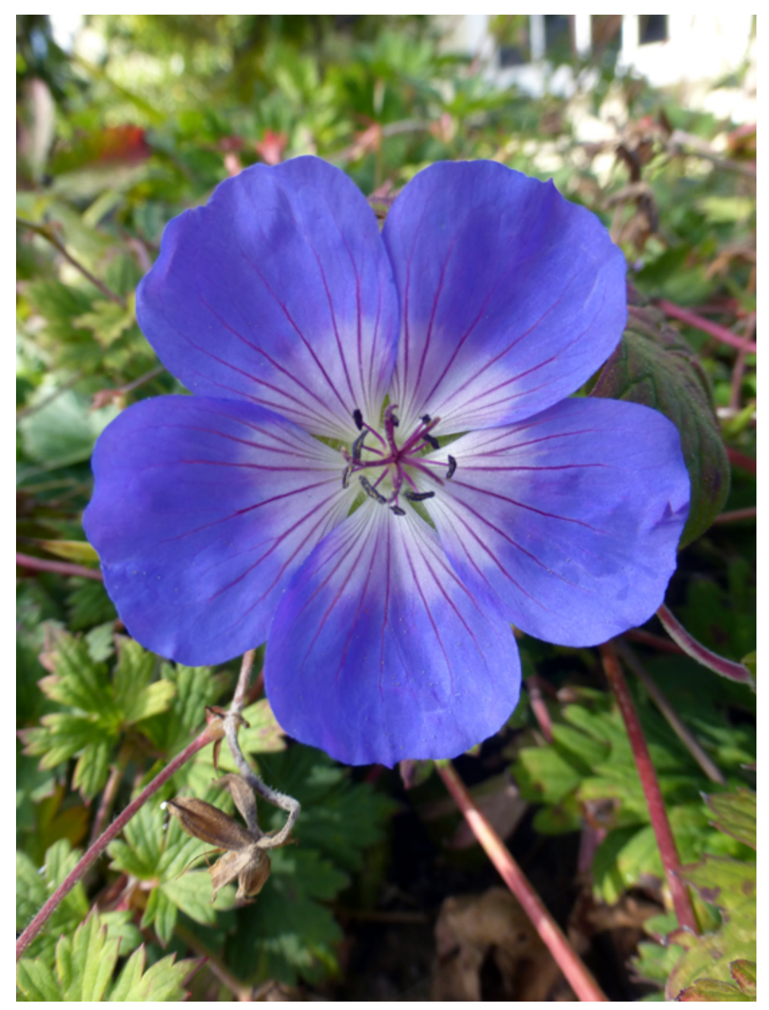
Photo taking by a student at Red2Green whilst looking for designs and patterns in nature prior to this workshop