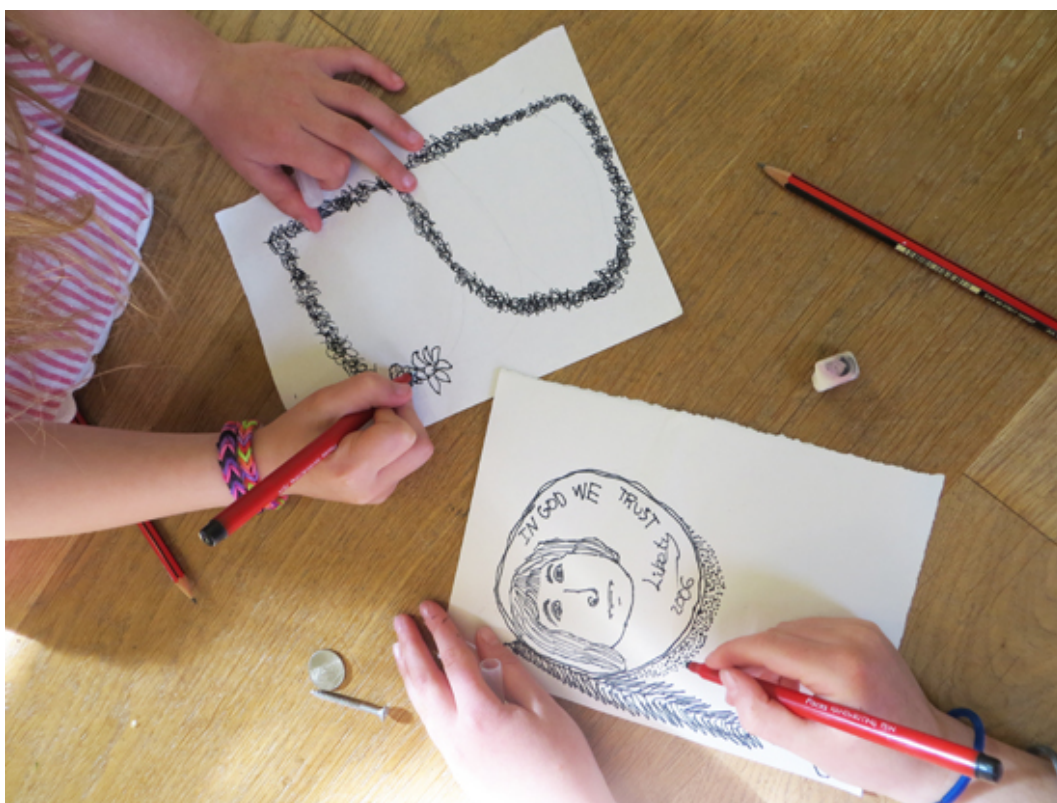
Typography for children

This resource introduces children to the art of typography. Exploring the creation of the letters of a typeface in an intuitive and fun way, this hour long session encouraged primary-aged children (7,8, and 9 years) to think about the structure and design of letters as having personalities. Taking our starting point from observational drawing, children went on to develop graphic onomatopieir.