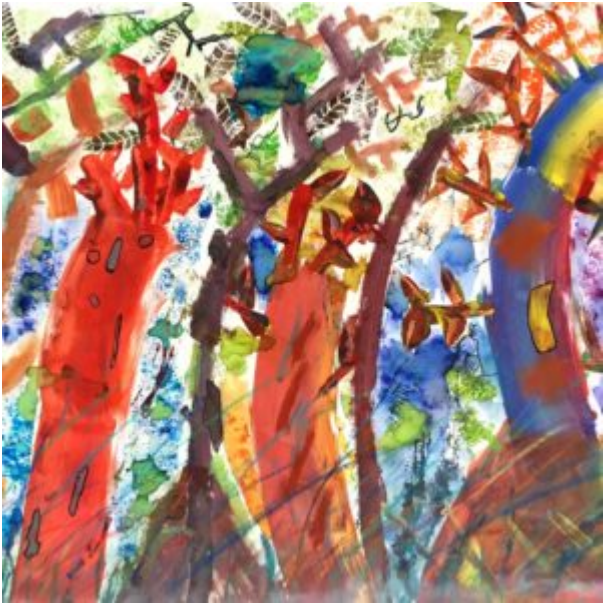
A large scale, colourful forest painting by Primary School children.