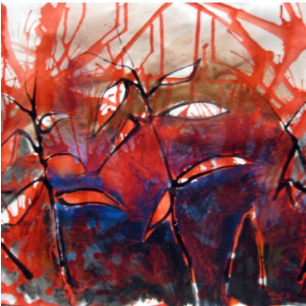
Artist Educator Sara Dudman shares a beautifully illustrated resource in which she enables teenagers to work together to create hedgerow-inspired drawings and paintings.