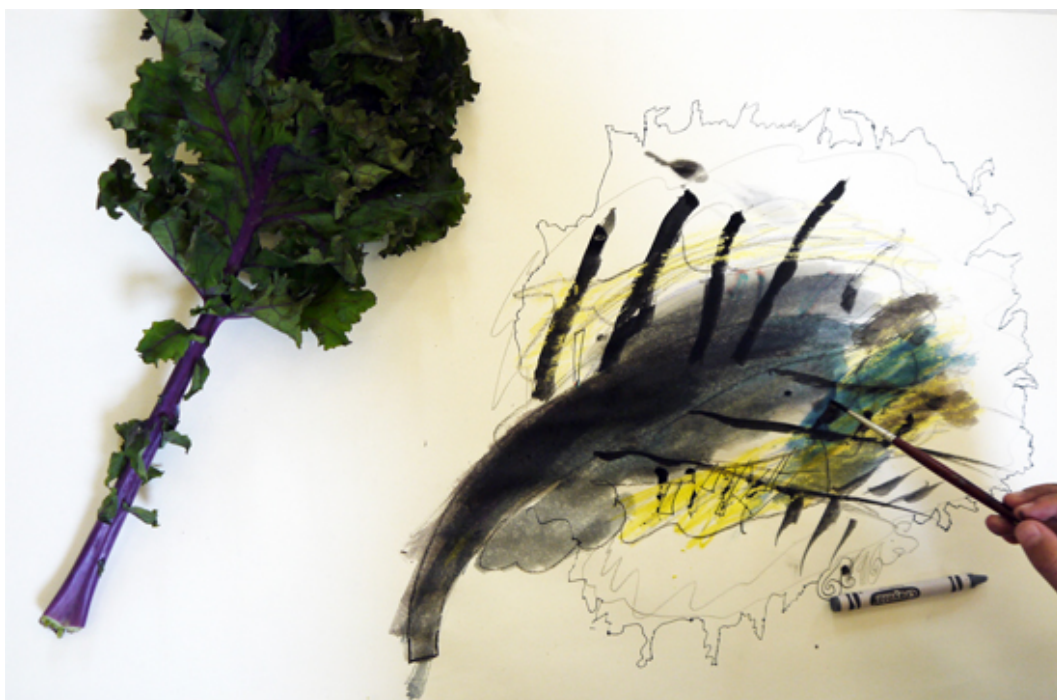
Curly kale watercolour study, by Kelly aged 7

This week in the Drawing Workshop for ages 6 to 10, we continued our exploration of drawing vegetables. The workshop introduced the children to using watercolour washes and explored themes of still life, restricted palettes, mixed media and tonal washes. The tapestries of Henry Moore were used as inspiration for the session.