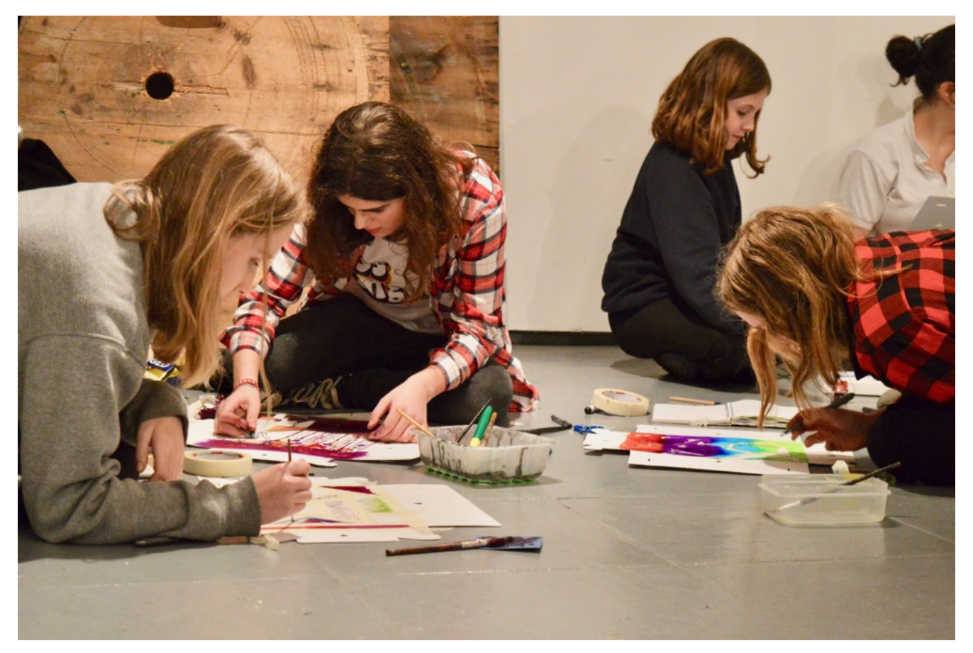
Schools, Colleges, Arts Organisations: Single and Multi-Users From £42

AccessArt is a UK Charity and we believe everyone has the right to be creative. AccessArt provides inspiration to help us all reach our creative potential.