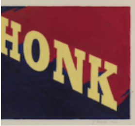
Ed Ruscha KIT ROOMS Tate and National Galleries of and Ruscha