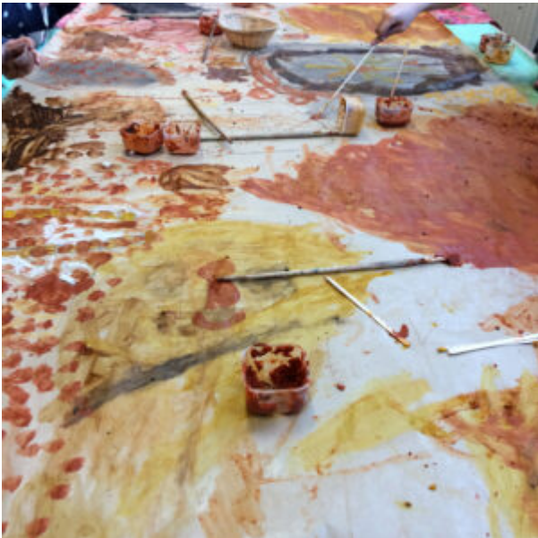
Painting A Storm