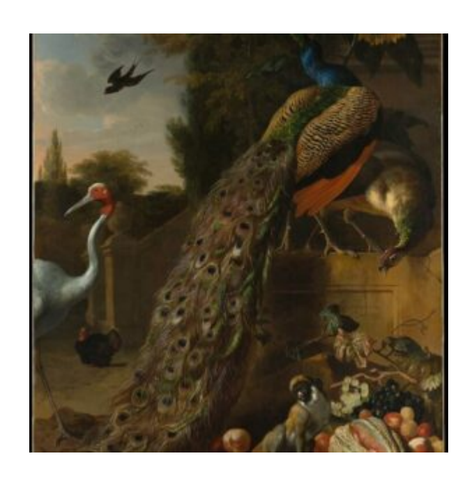
Explore still life paintings made in the 17th Century