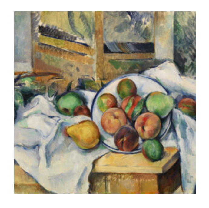
Pathway for years 3 & 4