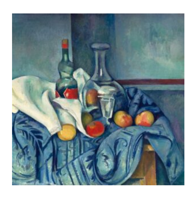
Explore the still life paintings made by Cezanne