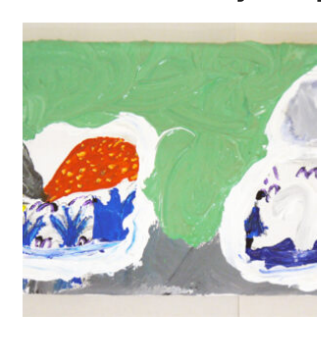
still life inspired by Cézanne