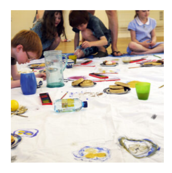
Paint Your corner shop