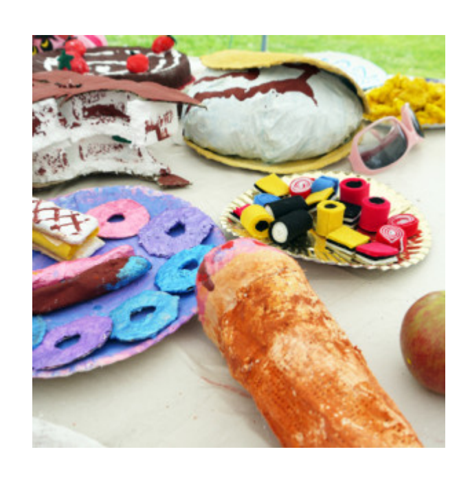
still life acrylic paintings