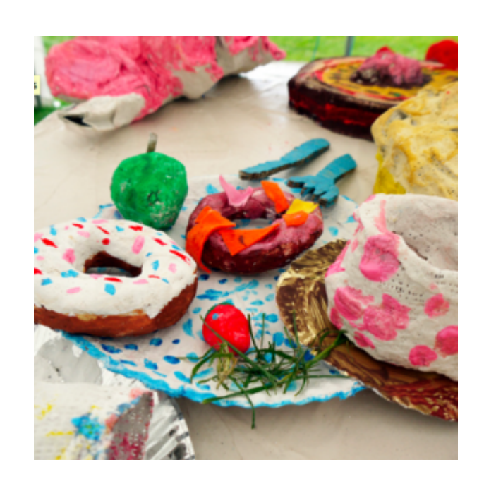
Pathway for years 3 & 4 Exploring still life