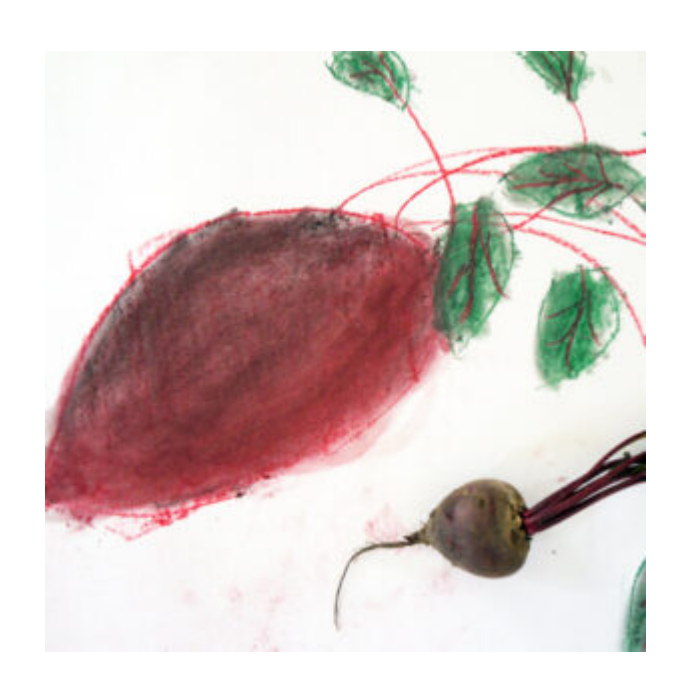
clay fruit tiles