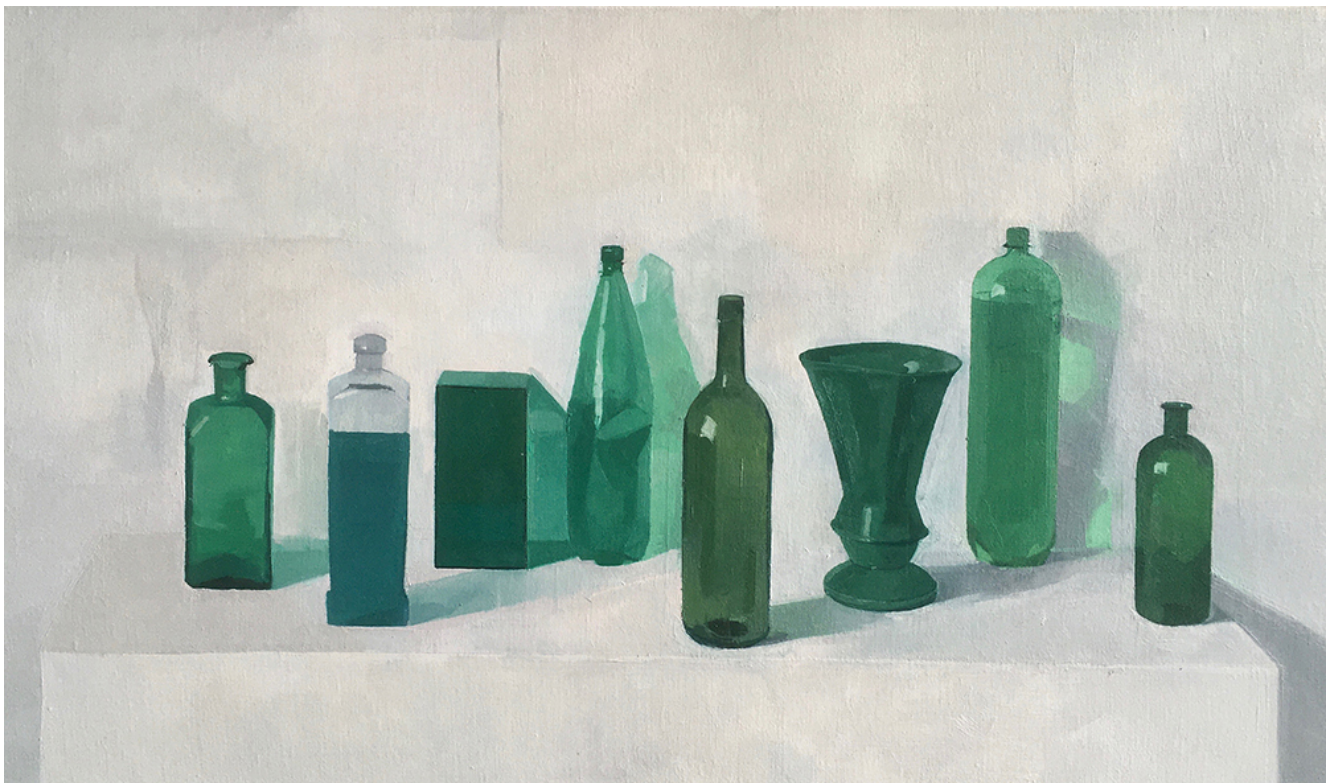
Arrangement in Green 75 x 45 cm oil on linen