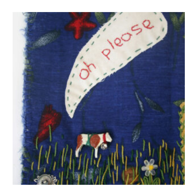
Felt and Embroidery Sets