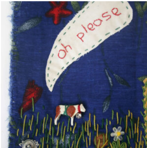
Felt and Embroidery Sets