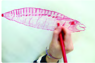
Backwards Forwards Drawing Exercise