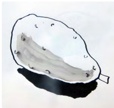
See 3 Shapes Drawing Exercise