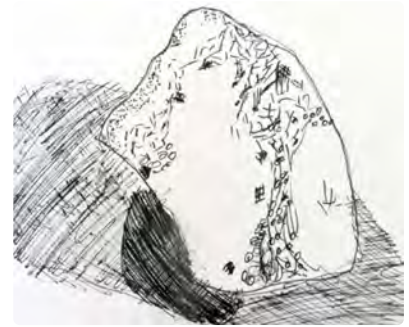
Thoughtful Mark Making Exercise