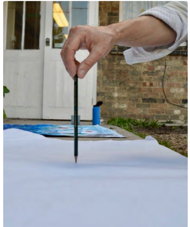
Anatomy of a Pencil