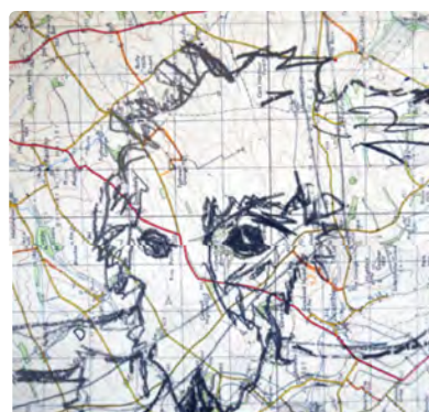
Making Stronger Drawings