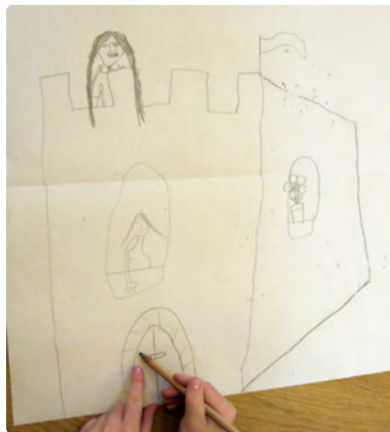
Very Simple Perspective Drawing Exercise