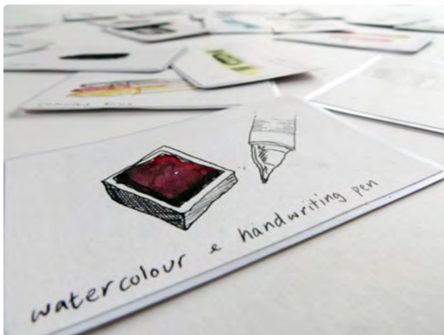
Drawing Materials Sample Cards