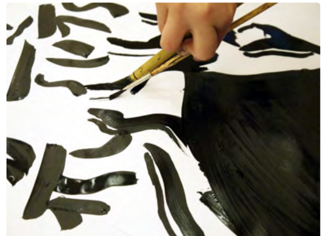
Ink Mark Making