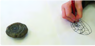
Continuous Line Drawing Exercise