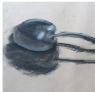
Show Me What You See Drawing Exercise