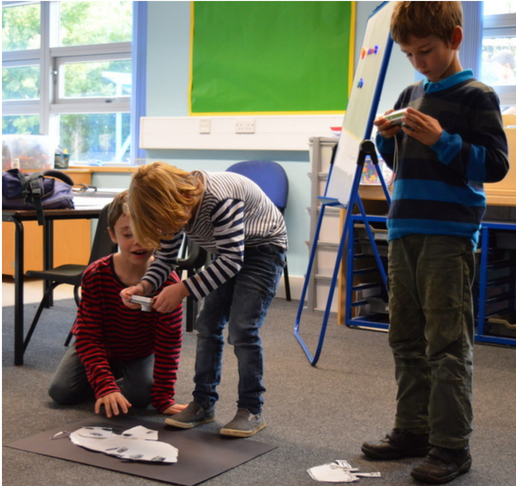
Year 3 & 4 pupils working together to animate their 'beasts' at Milton Road Primary School