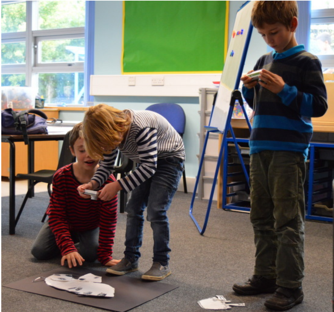
Year 3 & 4 pupils working together to animate their 'beasts' at Milton Road Primary School